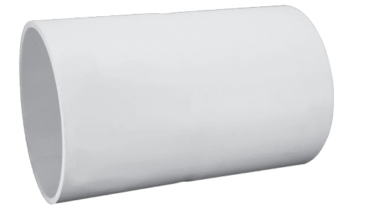
CAO Coupling (Gray) No Center Stop - Fabricated

CANTEX 6161652 is a 4 in. CAO Type C Coupling with no center stop used to join lengths of CAO conduit pipe together with two solvent weld socket ends.