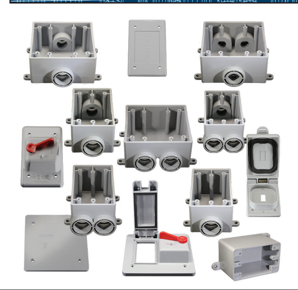
Dimensions are nominal